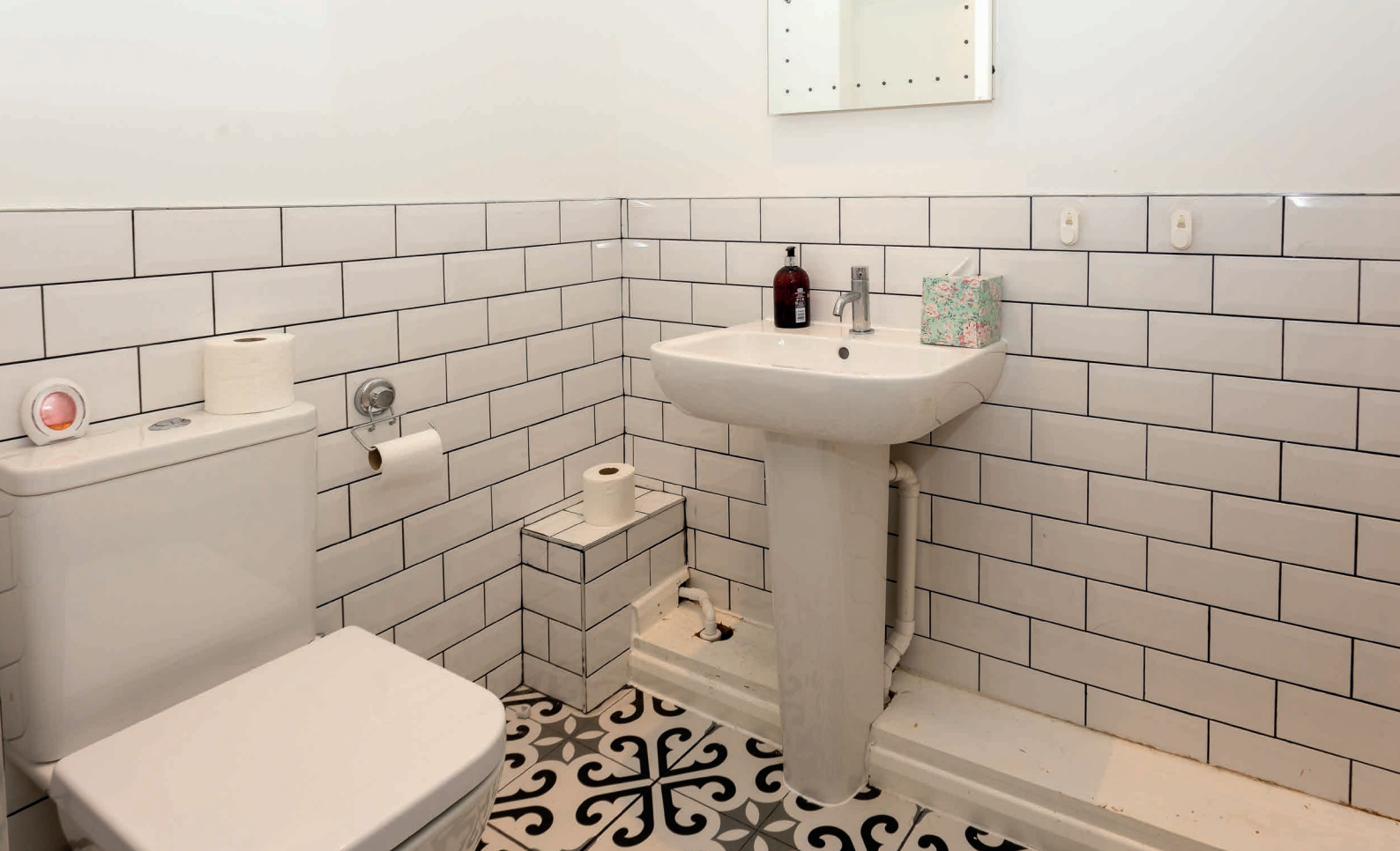
Third Floor 51.2 sq.m. approx.