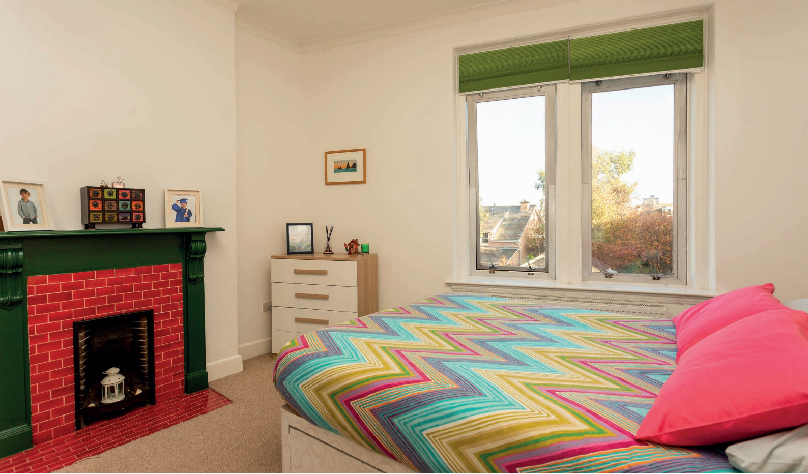
First Floor 79.0 sq.m. approx.