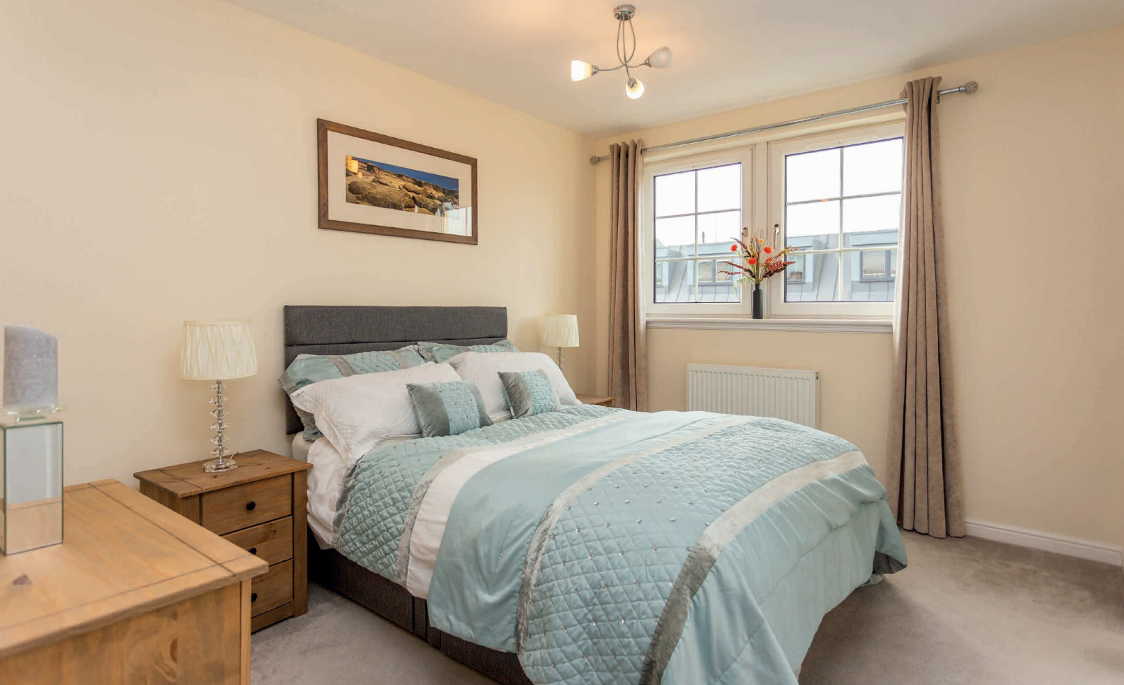
Second Floor 67.7 sq.m. approx.