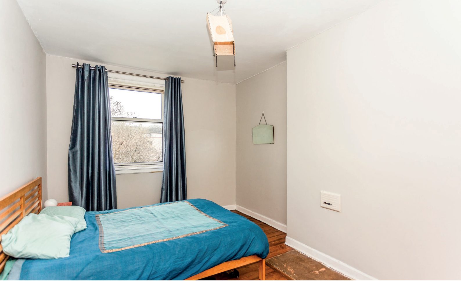
Second Floor 57.1 sq.m. approx.