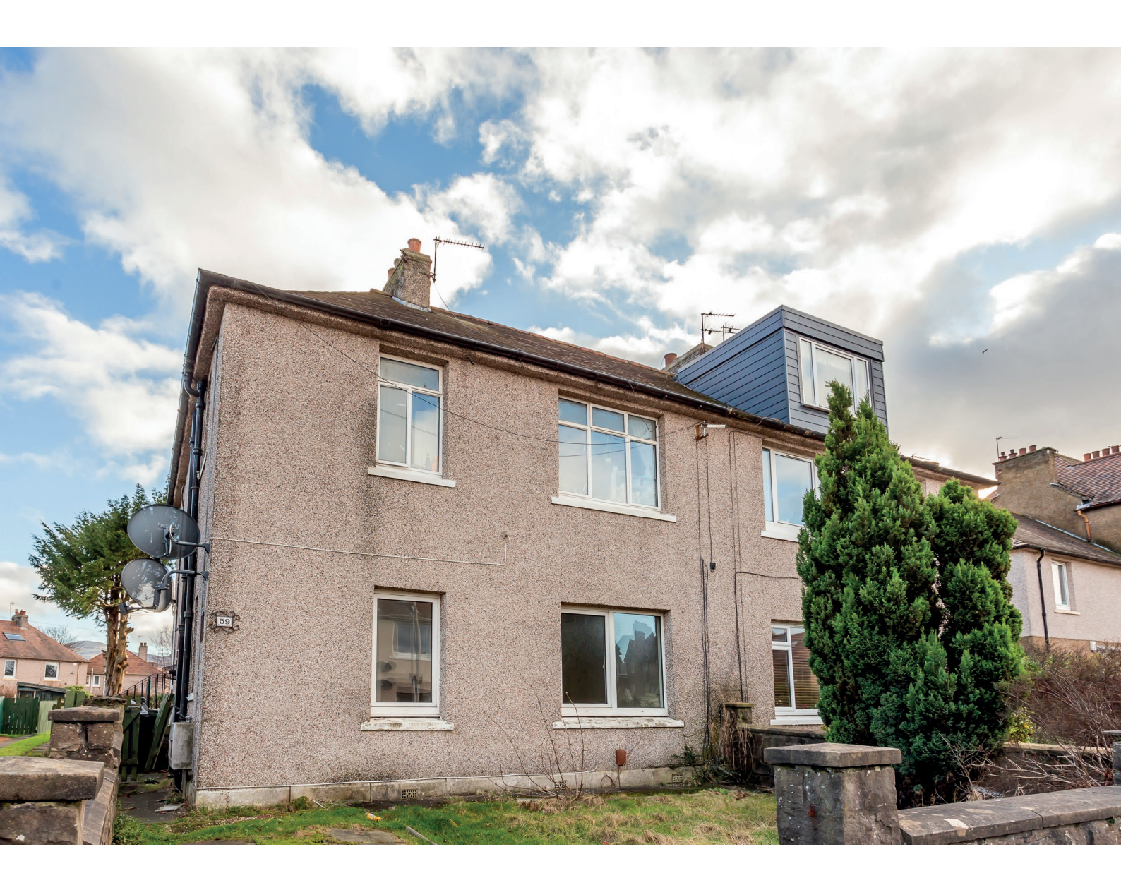
59 Parkhead Avenue Edinburgh EH11 4SF