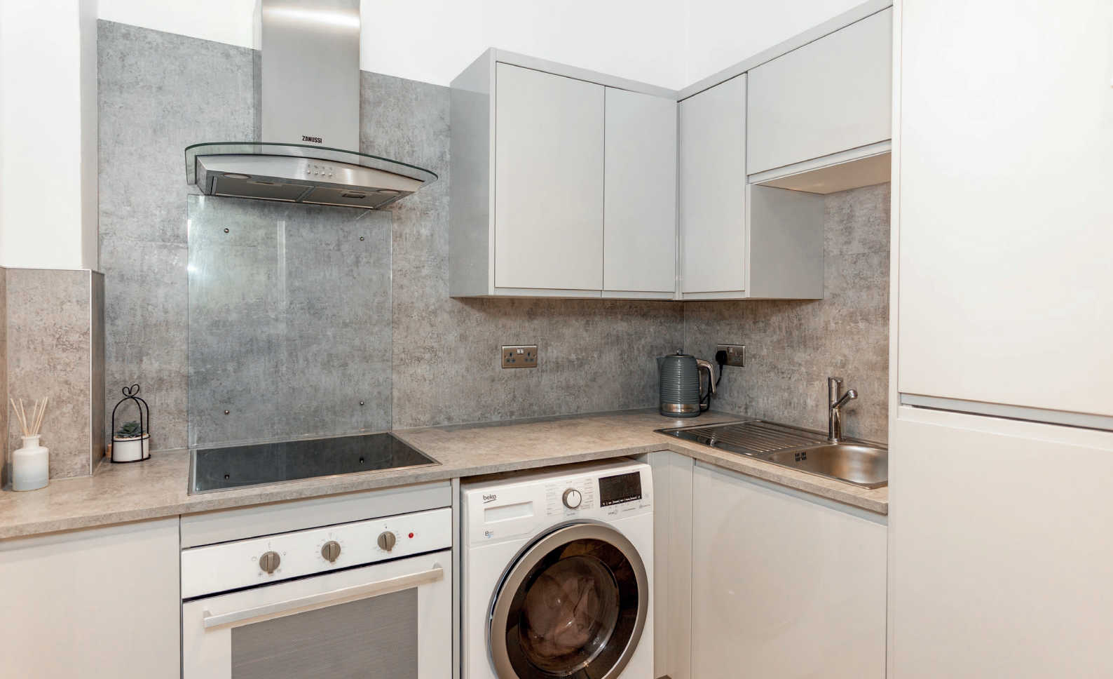
Third Floor 38.8 sq.m. approx.