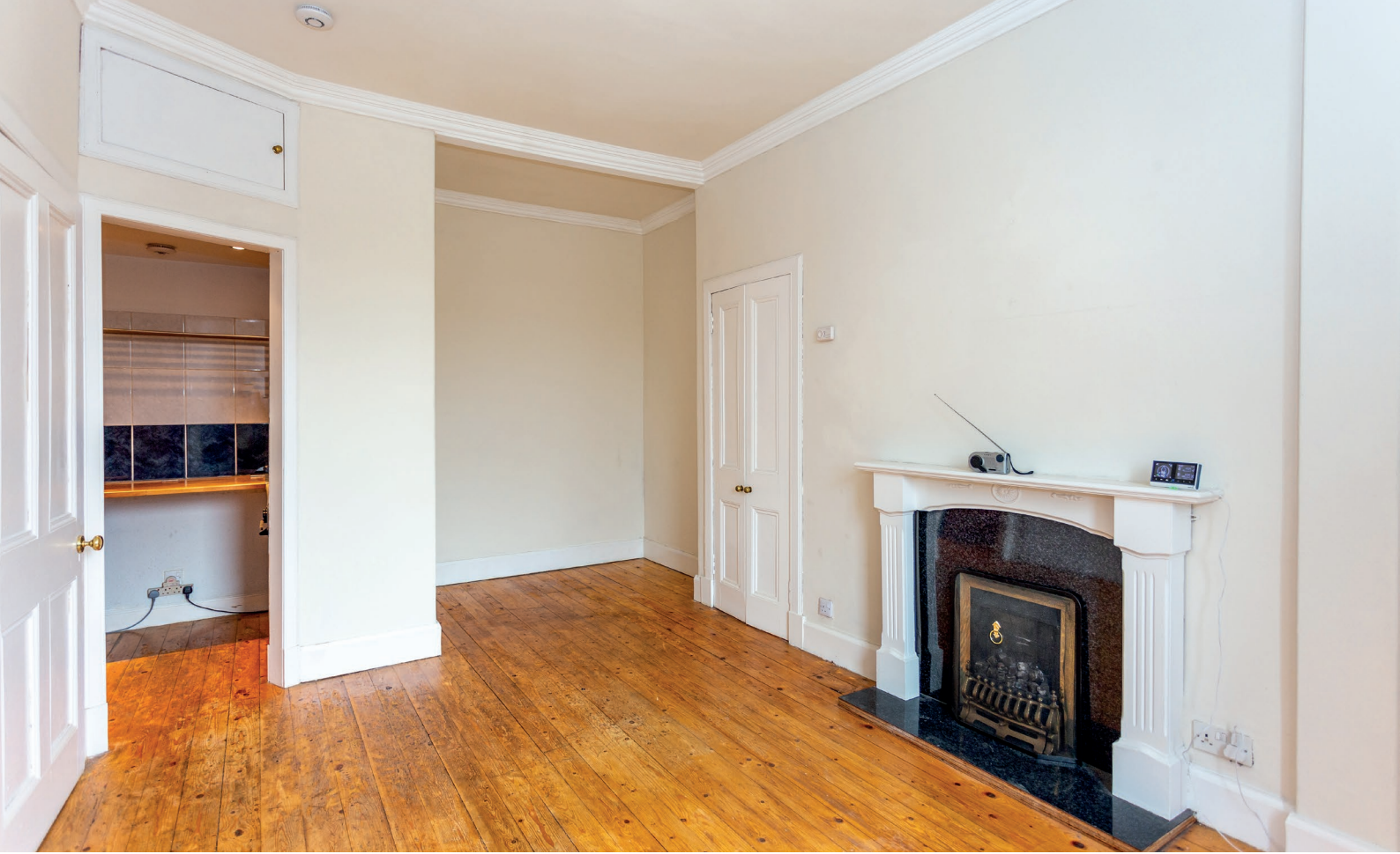
Ground Floor 42.6 sq.m. approx.