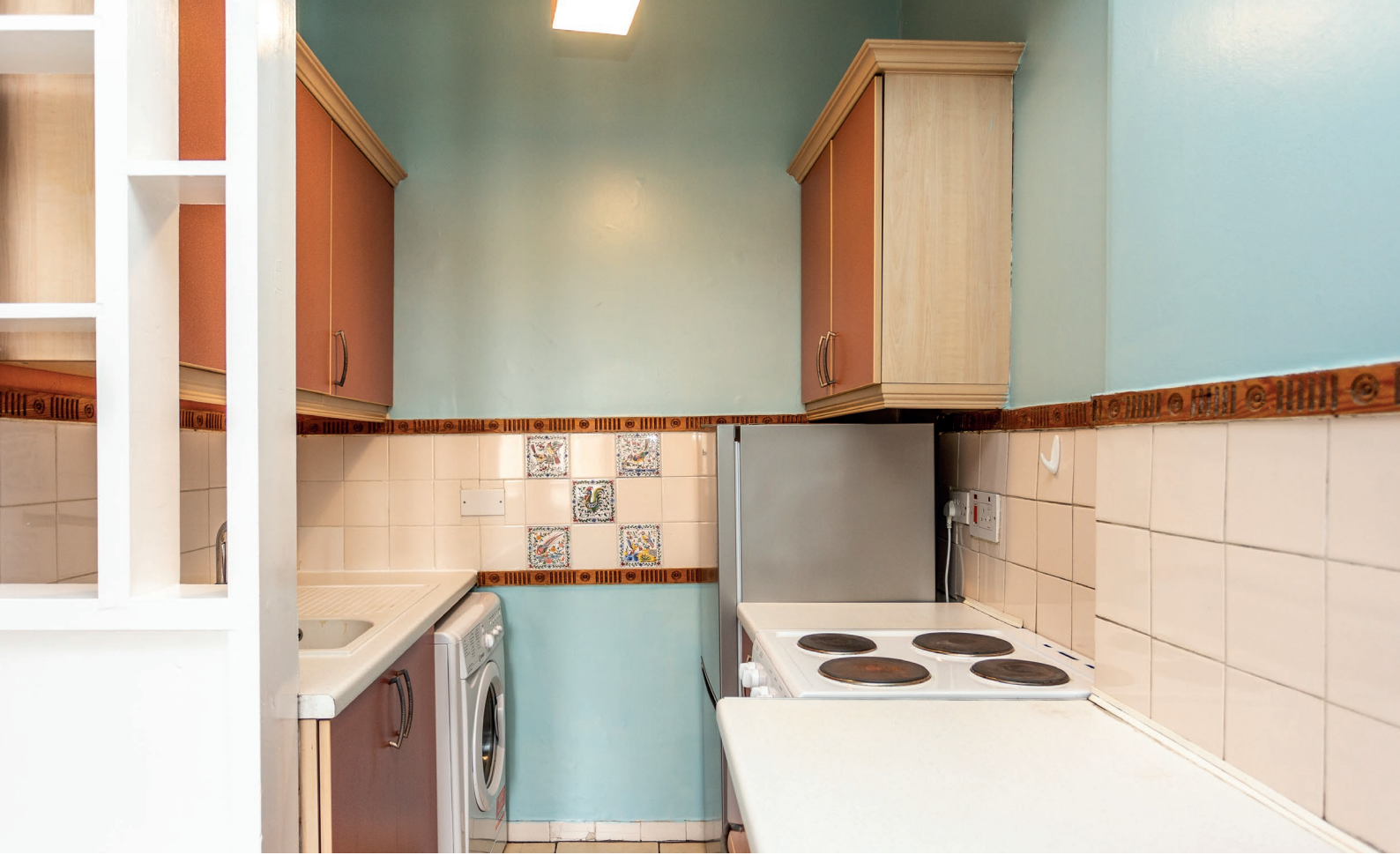
First Floor 37.0 sq.m. approx.