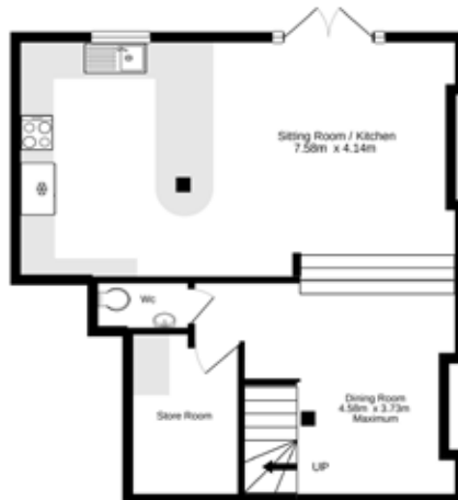
TOTAL FLOOR AREA - 115.0 sq.m. approx.

Whilst every attempt has been made to ensure the accuracy of the floorplan contained here, measurements of doors, windows, rooms and any other items are approximate and no responsibility is taken for any error, omission or mis-statement. This plan is for illustrative purposes only and should be used as such by any prospective purchaser. The services, systems and appliances shown have not been tested and no guarantee as to their operability or efficiency can be given. Made with Metagics 0.001