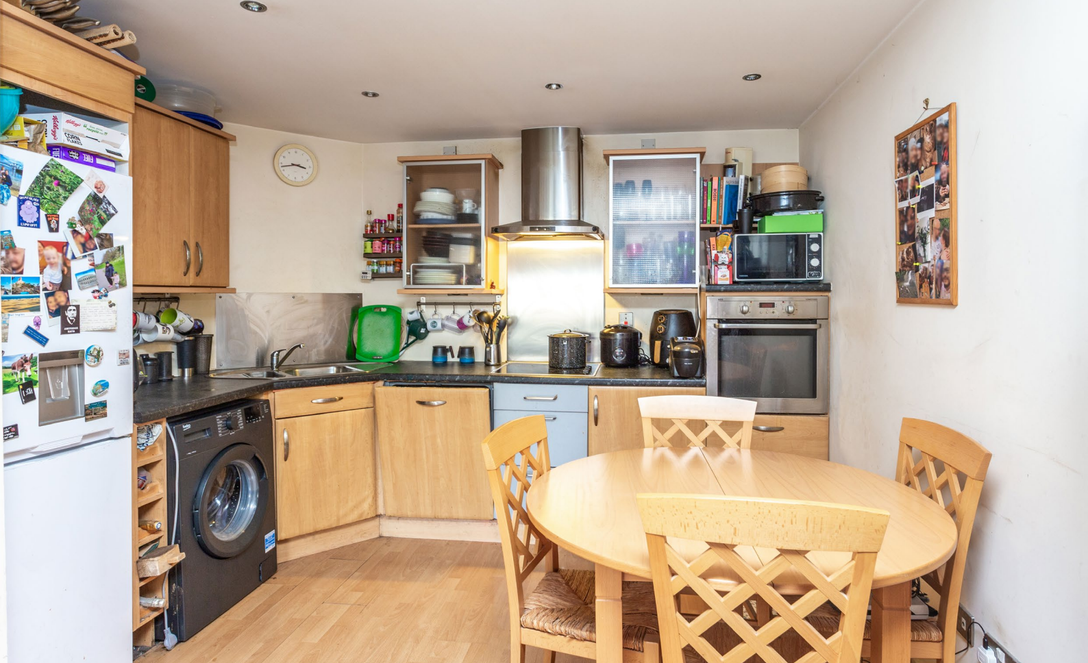
First Floor 70.0 sq.m. approx.