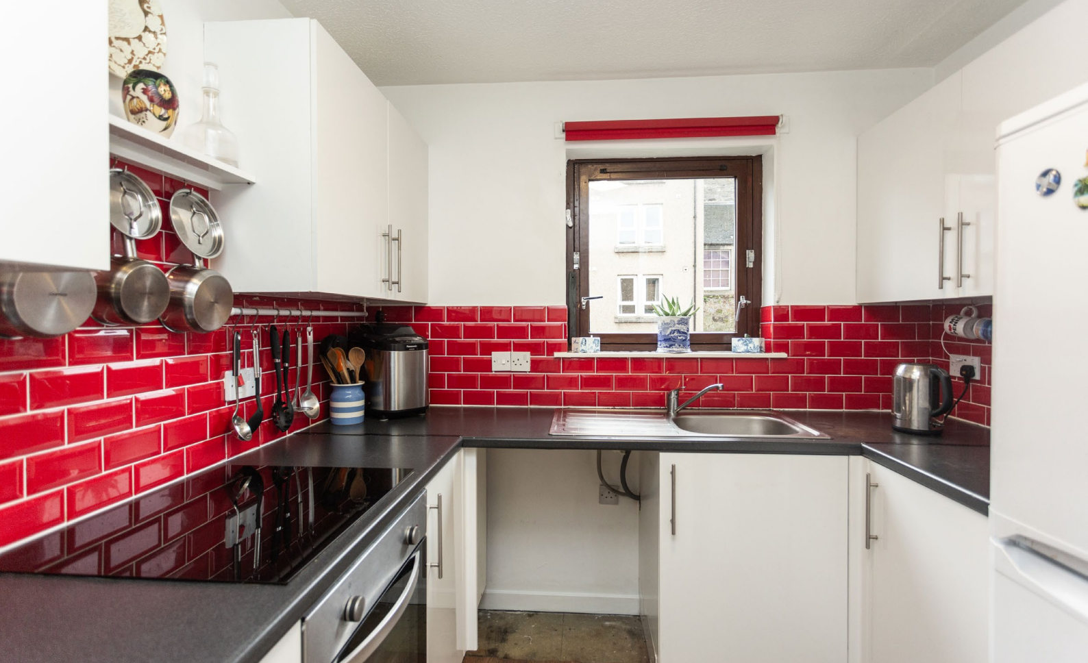
First Floor 54.4 sq.m. approx.