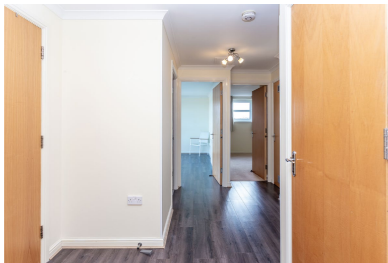
Fourth Floor 64.0 sq.m. approx.