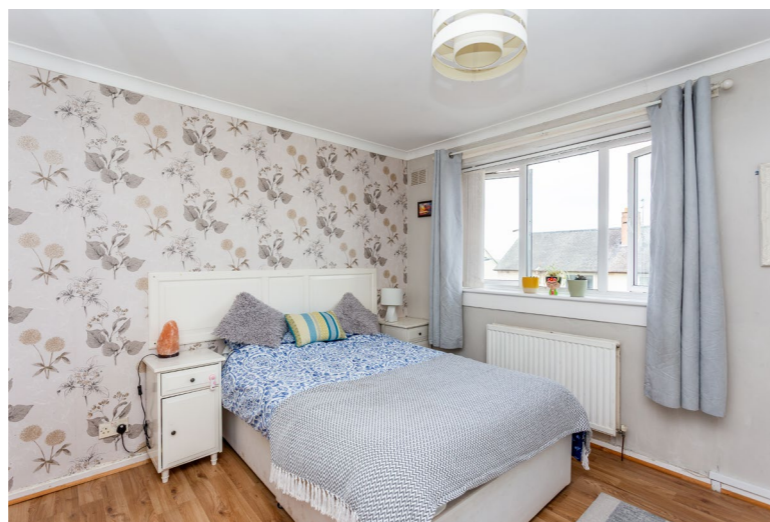
Ground Floor 46.5 sq.m. approx.